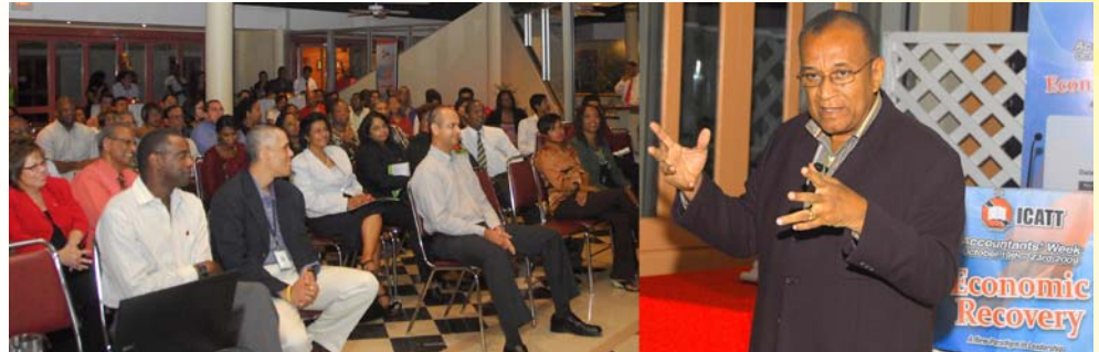
Participants enjoy an entertainment piece at the Members' Cocktail reception marking the close of Accountants' Week 2009